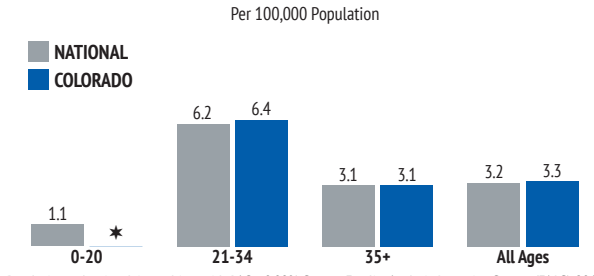
ALCOHOL-IMPAIRED DRIVING DEATH RATES BY AGE

Deaths in crashes involving a driver with BAC ≥ 0.08%. Source: Fatality Analysis Reporting System (FARS), 2018 ★ Fatality rates based on fewer than 20 deaths are suppressed.